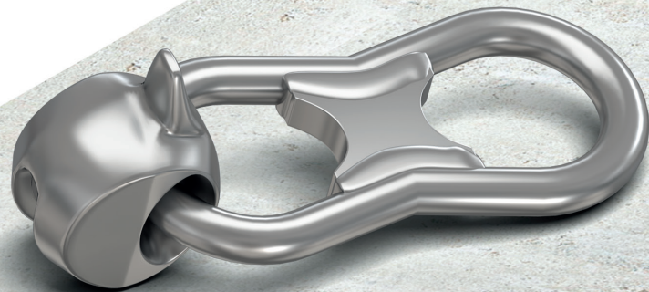
Ancon UniLift Locking Klaw WLL 1.3T - 32T