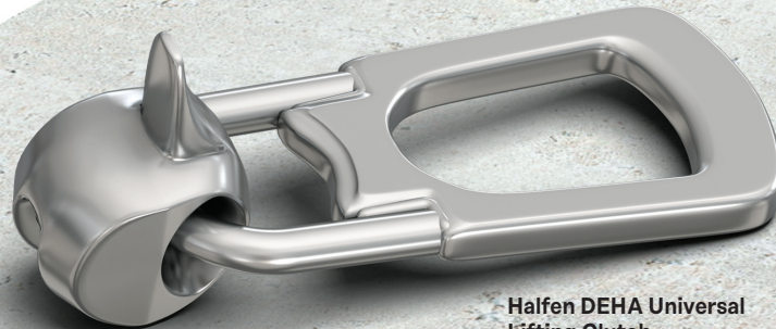
Halfen DEHA Universal Lifting Clutch WLL 32t