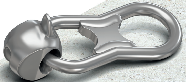
Ancon UniLift Locking Klaw WLL 1.3t - 32t