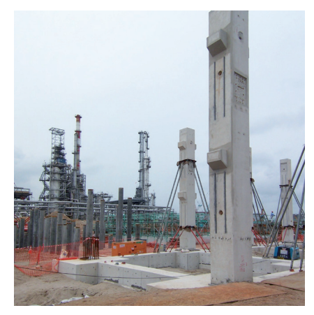
HALFEN HZA DYNAGRIP Channels cast vertically in columns to connect further components.

Please visit www.ancon.com.au for more information