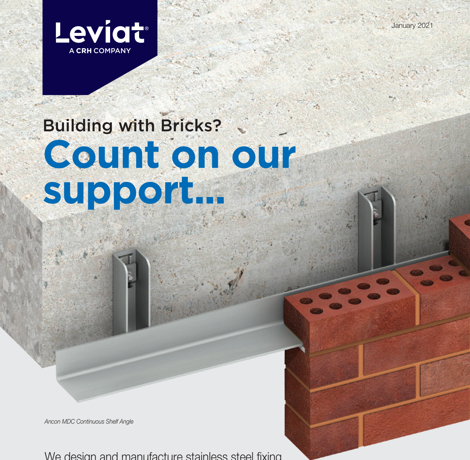
Ancon MDC Continuous Shelf Angle

We design and manufacture stainless steel fixing systems for the support and restraint of brickwork