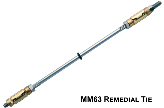
MM63 REMEDIAL TIE