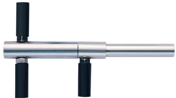
INNER SETTING TOOL