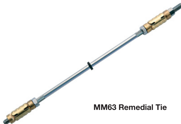
MM63 Remedial Tie

Note: Test results are a mean of 5 tests