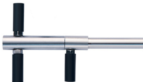
Inner Setting Tool