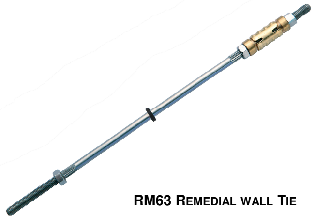
RM63 REMEDIAL WALL TIE

Normal handling precautions should be taken to avoid physical injury. Ancon Building Products cannot be held responsible for any injury as a result of using our products, unless such injury arises as a result of our negligence.